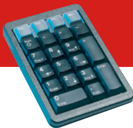
G84-4700 PRB (1)